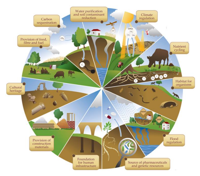
Figure 1. Diagram showing the ecosystem services provided by soil (From Bayeve et al. 2016, adapted from <a href="http://www.fao.org/resources/infographics/infographics-details/en/c/284478/">http://www.fao.org/resources/infographics/infographics-details/en/c/284478/</a>)

Soil is a complex system at the interface between atmosphere, lithosphere, hydrosphere and biosphere, which sustains plant, microbial, animal and human life. Soil connects to water and air, and natural biogeochemical and hydrological cycles, and is a major global reservoir of biodiversity. By interacting with all these components, soils represent a natural capital that provides services of fundamental importance for human well-being (Figure 1).