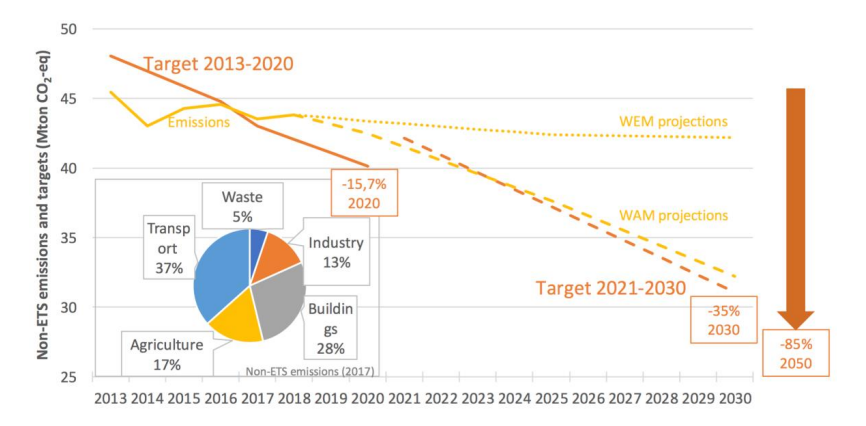
Figure 3. Flemish greenhouse gas emissions and targets from sectors not covered by the EU Emissions Trading Scheme (non-ETS) (Taken from the presentation of An Dewaele, Department of Environment and Spatial Development).<sup>2</sup>

Global climate change caused by human-induced increases in greenhouse gases represents one of the biggest scientific and political challenges of the 21st century. To ensure compliance with EU commitments to the goals of the Paris Agreement on climate change, Belgium's National Climate Committee instructed members of the federal and regional governments to prepare an adaptation strategy. In response, the Flemish climate policy includes the objective for the non-ETS sector of a 35% reduction in greenhouse gas emissions by 2030 compared to 2005 (Figure 3) and provides guidance on how this objective and a low-carbon future might be achieved, including the expectation that the Land Use, Land Use Change and Forestry (LULUCF) sector will be net zero over the period up to 2030. This chapter considers the importance of soils in a changing climate, exploring optimal ways for Flanders to enhance soil carbon sequestration and compensate greenhouse gas emissions, enhance the resilience of soils and their functions to climate change, and control climate hazards for soils, such as soil erosion by heavy rainfall events and salinisation caused by rising sea levels. The ultimate aim is to identify opportunities that will enhance the contribution of soils to climate mitigation and adaptation in Flanders.